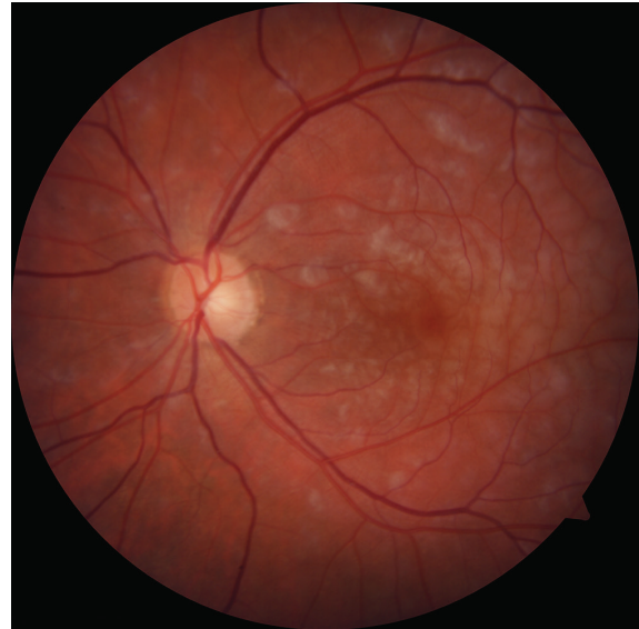
Figure 1: The fundus of the left eye shows numerous white dots located around the optic disc and scattered throughout the posterior pole of the retina. The fovea is orange-yellow with a granular appearance.

Following an initial diagnosis of multiple evanescent white dot syndrome (MEWDS),