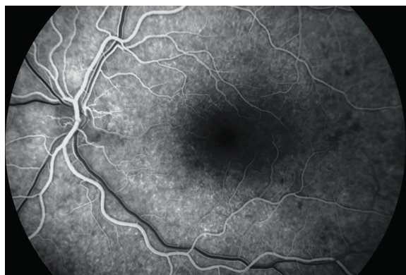
Figure 3: Fluorescein angiography (FA) shows subtle early hyperfluorescence of the dots with late staining.