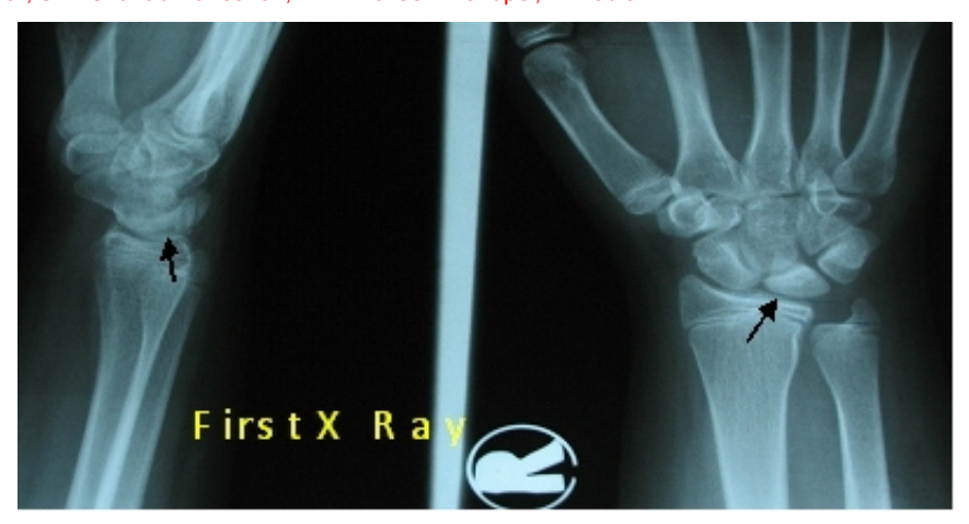
Figure 1: Radiographs showing sclerosis of lunate bone six months after the trauma

Isotope scan with Tc 99m revealed increased lunate bone absorption and magnetic resonance imaging (MRI) confirmed signal change and deformity of lunate suggesting avascular necrosis (figure 2, 3). The patient wore a long arm cast for six weeks and stopped all of her sporting activities. In addition, she underwent physical therapy to improve hand grip strength. Clinically, wrist pain and other symptoms resolved. After one year, radiographic pattern returned to normal (figure 4), and clinical manifestations disappeared.