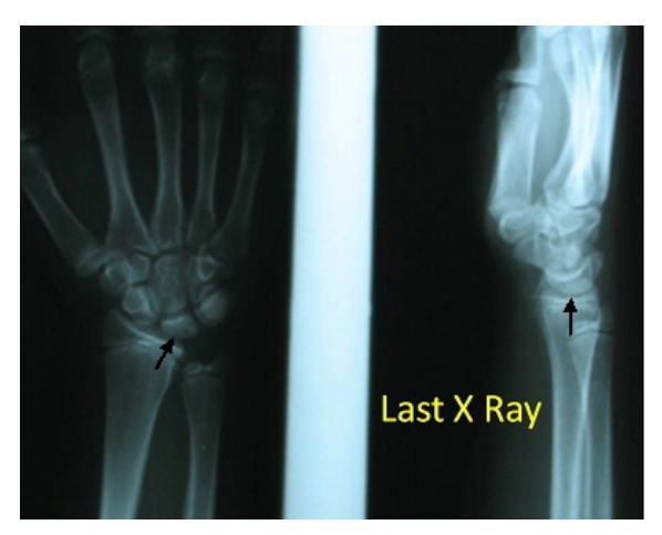
Figure 4: Radiographic pattern of the wrist twelve months after trauma showing the return to normality.

Usually, the pain is activity related and subsides with rest. In the early stages, when symptoms of disease are similar to wrist sprain,