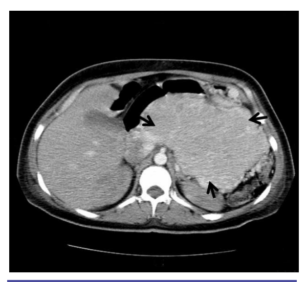
Figure 1: Abdominal computed tomography scan showing the pancreatic tumor.

alpha 1 antitrypsin and vimentin. Re-evaluation of IHC, done at the Department of Pathology, St. Michael Hospital, Toronto, Ontario, Canada, disclosed cytoplasmic immunopositivity for PTHrP (figure 2), somatostatin, calcitonin, serotonin and chromogranin. Ki-67 nuclear labeling index was estimated at 1-3%.