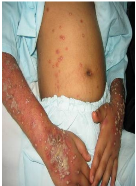
Figure 1: Skin lesions of the patient with Sweet syndrome.

Twelve days after discharge, she was readmitted with high grade fever, and discrete erythematous papular skin eruptions, starting from 7 days before admission. Papular lesions gradually increased in number and involved the face, anterior aspect of trunk, upper and lower extremities, palms, soles, and also the hard palate and palatal tonsils. Most of papules rapidly evolved to pustules and after coalescing, caused large crusted plaques over the face and extremities, with mild tenderness but without any pruritus (figure 1).