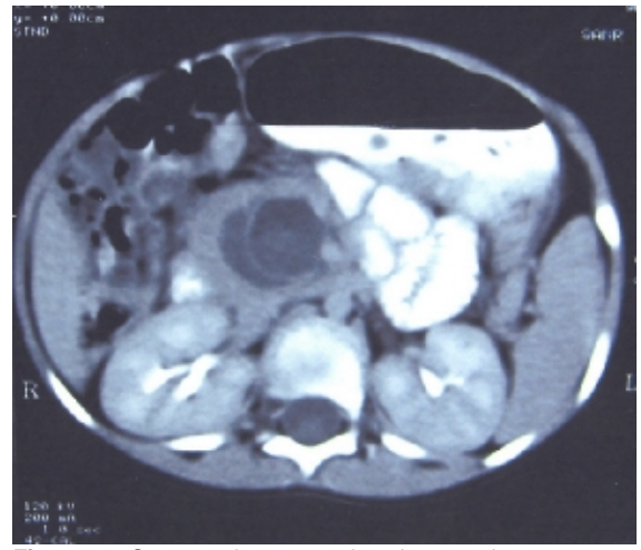
Figure 1: Computed tomography shows a homogenous mass arising from the head of the pancreas.