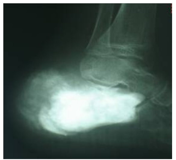
Figure 2: Lateral view radiograph showing dense sclerotic lesion in calcaneus in association with cortical bone destruction and extraosseous extension laterally.

Calcaneal biopsy was performed. Histological examination revealed malignant mesenchymal