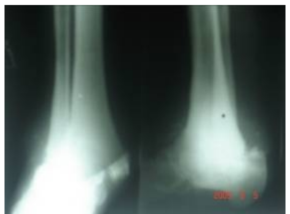
Figure 1: radiograph (anteroposterior view) showing sclerotic calcaneal bone lesion with cortical destruction and irregular border.

swelling involving the left ankle joint and foot. The swelling was tender and the mobility at the joint was restricted. The overlying skin was normal. The results of hematological and biochemical investigations revealed a normal hemogram. Serum levels of alkaline phosphatase (ALK) and lactate dehydrogenase (LDH), which are elevated in bone destruction and metastasis, were in normal range. Liver and renal function tests were normal as well. A plain chest radiography showed no abnormality. Radiography of the left heel showed sunburst appearance with dense sclerotic lesion in calcaneus associated with cortical bone destruction and extraosseous expansion laterally, which are typical radiographic features of primary osteolytic bone tumor (figures 1,2). Adjacent bones were apparently normal. Calcaneal CT scan showed a large osteolytic lesion. Radionuclide bone scan was negative for any skip lesion.