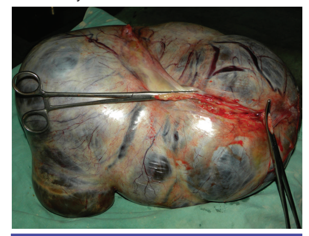
Figure 2: This cystic mass (approximately 40 cm×30 cm×25 cm in size, pinkish in color, and with a smooth surface) arising from the right ovary was removed via laparotomy.

abdomen after vaginal delivery. After proper counseling, decision for laparotomy was taken in the postpartum period. All the preoperative investigations were within normal limits. On the 8th postpartum day, laparotomy was performed under general anesthesia. A cystic mass (approximately 40 cm×30 cm×25 cm in size, pinkish in color, and with a smooth surface) arising from the right ovary was found. The left fallopian tube and ovary was healthy. The right ovary, along with the mass and fallopian tube, was removed. Infracolic omentectomy and left tubectomy was done (as per patient and her husband's consent). The intact cyst was multiloculated, weighed 11,000 gm, and was filled with fluid. Figure 2 demonstrates the cystic mass after it was removed via laparotomy. There was mild omental adhesion, but no ascites was observed. Specimens and peritoneal washing were sent for histopathology examination. The intraoperative and postoperative periods were uneventful, and she was discharged on the 8th postoperative day. In subsequent follow-up, no abnormality was detected.