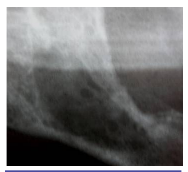
Figure 3: Cropped and magnified view of right side of panoramic radiograph shows paunch out radiolucency

An incisional biopsy was obtained from the mass with the provisional diagnosis of malignant mesanchymal tumor. Histopathology examination revealed malignant plasma cells with