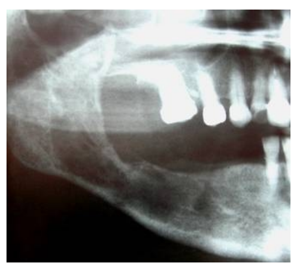
Figure 2: The panoramic view of the patient's face. It shows large ill-defined radiolucency in right mandibular side with multiple small round lesions that are paunch out.

An orthopantograph revealed a paunch out radiolucencies in rarefied area extending from the first molar to the ascending ramus (figure 2, 3). The skull radiography was normal. Langerhans histiocytosis and metastatic malignant lesions should be included in radiographic differential diagnosis. Differential diagnosis of multiple myeloma from other metastatic bone lesions necessitate further clinical, histopathological and laboratory examination. Consequently, the patient was referred to a surgeon and an oncologist for further examination and treatment.