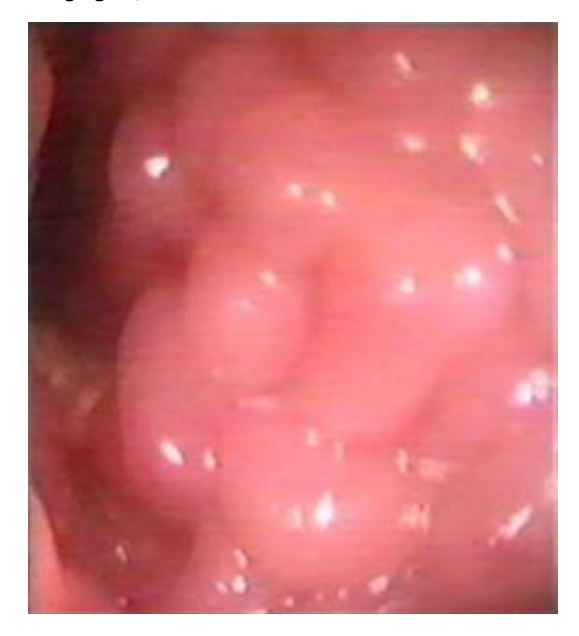
Fig 3: Endoscopic view of rectosigmoid area in a patient with NLH

majority of our patients had been treated repeatedly with antibiotics with the impression of bacterial colitis before referring to our center. The significant lag between the onset of rectal bleeding and final diagnosis in our cases indicate that frequently the possibility of NLH was not considered in the diagnosis of fresh rectal bleeding in this age group. The age of onset and clinical presentation of our cases were similar to the previously reported studies on NLH. <sup>5-8</sup>