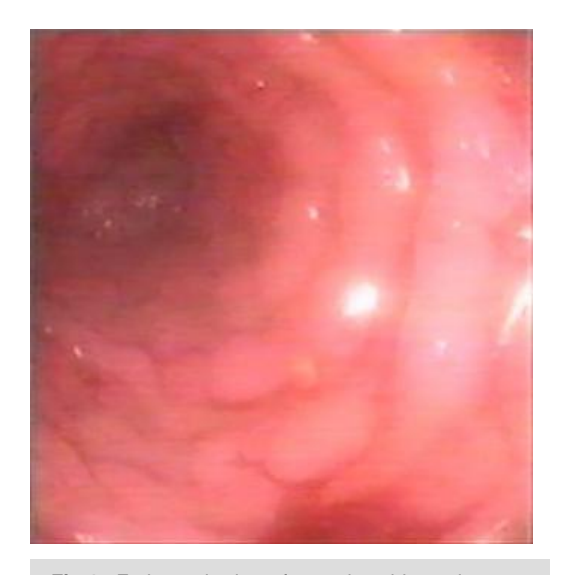
Fig 4: Endoscopic view of rectosigmoid area in a patient with NLH

Considering the age of onset of rectal bleeding, the specific area of gastrointestinal involvement, clinical presentations, and the response to dietary manipulation, it is believed that NLH, at this age group, is a specific presentation of cow's milk allergy and is limited to rectosigmoid area only. It is conclude that: