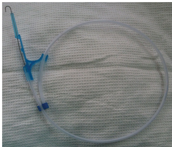
Figure 1: Guide wire «j» tip used for changing the tracheal tube.

The most common cause of reintubation during anesthesia in the operating room is upper airway obstruction and hypoventilation. Endotracheal tube cuff laceration during anesthesia is often associated with respiratory complications, reduction of arterial haemoglobin oxygen saturation, and inappropriate ventilation of the lungs. Therefore, the exchange of endotracheal tube and proper replacement with an adequate tube plays an important role. Care must be taken to reduce neck manipulation, minimize use of laryngoscopy, and cause less sympathetic stimulation. Guide wire "j" tip catheter, which is a central venous catheter, is suggested for the exchange of a tracheal tube during anesthesia without using fiberoptic bronchoscope or laryngoscopy (figure 1).