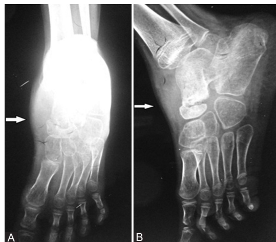
Figure 1: Pre-treatment radiographs of the foot (AP and oblique) showing diffuse osteopenia with narrowing of the talonavicular joint and erosion of the articular surface of talus and navicular and prominent soft tissue.

The diagnosis of spinal and major joint tuberculosis such as the hip and knee is relatively easy. In contrast, the diagnosis of tuberculosis of small bones of the ankle and foot are often difficult