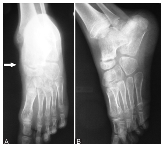
Figure 3: Post-treatment radiographs (AP and oblique) showing remineralization of bones with sclerosis of joint margins and reformation of the joint space of the talonavicular joint and disappearance of soft tissue.

and confusing; leading to delayed treatment and increased risks of secondary infection. 6