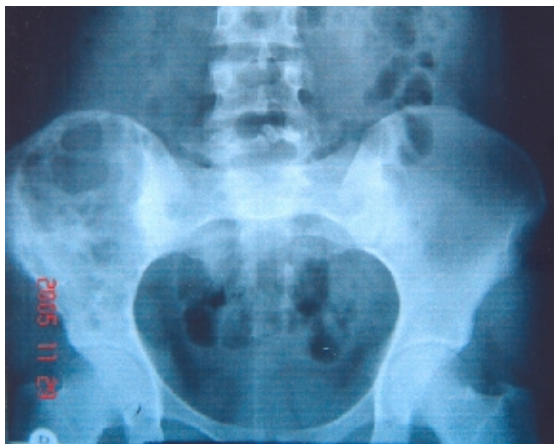
Fig1: Multiple cystic lesions in the right ilium.

In our hospital, the patient was examined carefully again. She had no hepatosplenomegaly and her only positive findings were right flank tenderness and limited internal rotation of the right hip joint. On plain radiography of the pelvis, multiple cystic lesions were present throughout the right iliac bone (fig 1). Chest x ray was normal. Barium enema for ruling out of Crohn disease or ulcerative colitis was done, but revealed no positive findings. Then, fistulography was done (fig 2a) which revealed a large cystic lesion in almost all of the right iliac bone.