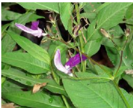
Figure 1: Aerial parts of Brillantaisia lamium .

The aerial parts of B. lamium Benth, were collected in January 2008 in Korup, South-west region of Cameroon (figure 1). The botanical