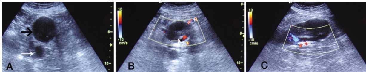
Figure 1: Transverse grayscale sonogram (A) reveals aneurismal dilatation of superior mesenteric artery (black arrow), which is significantly larger than abdominal aorta (white arrow). Color Doppler sonogram (B, C) reveals significant circumferential intraluminal thrombosis of superior mesenteric artery with a narrow patent lumen (white arrow) both in transverse and sagittal views.

Since then; he has remained asymptomatic and stable, with no evidence of further expansion of his aneurysms in routine sonographic examinations.