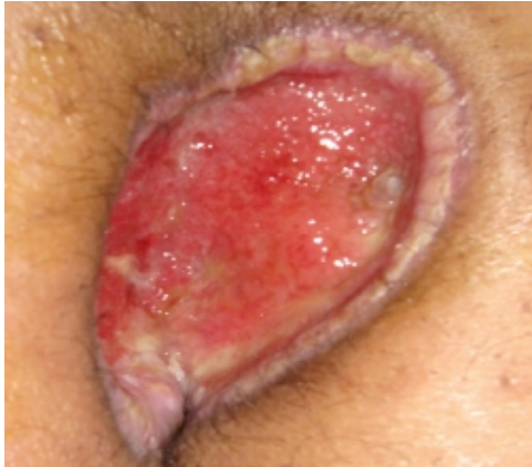
Figure 1: Ulcerative lesion in long-standing pilonidal sinus.

A 52-year-old man who was a retired military electronic technician, presented with malodor discharge from intergluteal cleft since 6 years ago. He noticed an ulcerated mass in the place since 3 months before, which gradually increased in size and had irregular borders (figure 1). He had a history of 35 pack-year cigarette smoking and 2-3 grams opium ingestion per day. No inguinal lymphadenopathy was detected. Laboratory evaluation for HIV infection was negative.