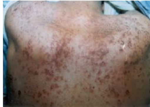
Figure 2: Porokeratotic lesion of the back skin.