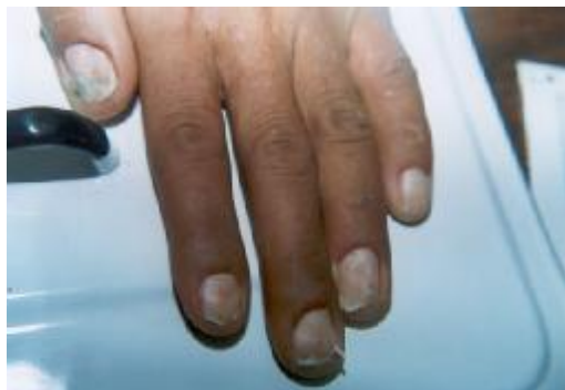
Figure 3: Nail notching with distal onycholysis and white and red bands.