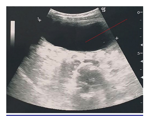
Figure 1: Ultrasonography shows a cystic mass in the peritoneal cavity.

All children presented abdominal pain, two had abdominal distension, and three had fever. Abdominal mass was revealed by palpation in two patients, and one patient experienced vomiting. The results of the hydatid serological test were positive in all cases. Abdominal ultrasonography and computed tomography showed cystic masses in the peritoneal cavity with a diameter ranging from 5 to 14 cm (figure 1). Four cysts were in the pelvic peritoneum, and the other six were located in the mesentery, adherent to the serosa of the small gut and colon (figure 2). Except for one, all other cysts were independent of other abdominal viscera. That one cyst arose from the mesentery and was