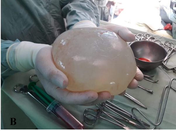
Figure 3: A) Peritoneal hydatid cyst bulges out through the incision, B) A hydatid unilocular cyst is shown in this figure.