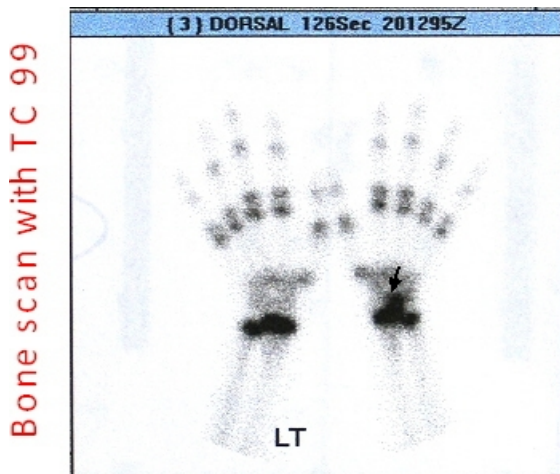
Figure 2: Bone scan with Tc 99m Isotope revealing increased lunate bone absorption six months after the trauma.

Isotope scan with Tc 99m revealed increased lunate bone absorption and magnetic resonance imaging (MRI) confirmed signal change and deformity of lunate suggesting avascular necrosis (figure 2, 3). The patient wore a long arm cast for six weeks and stopped all of her sporting activities. In addition, she underwent physical therapy to improve hand grip strength. Clinically, wrist pain and other symptoms resolved. After one year, radiographic pattern returned to normal (figure 4), and clinical manifestations disappeared.