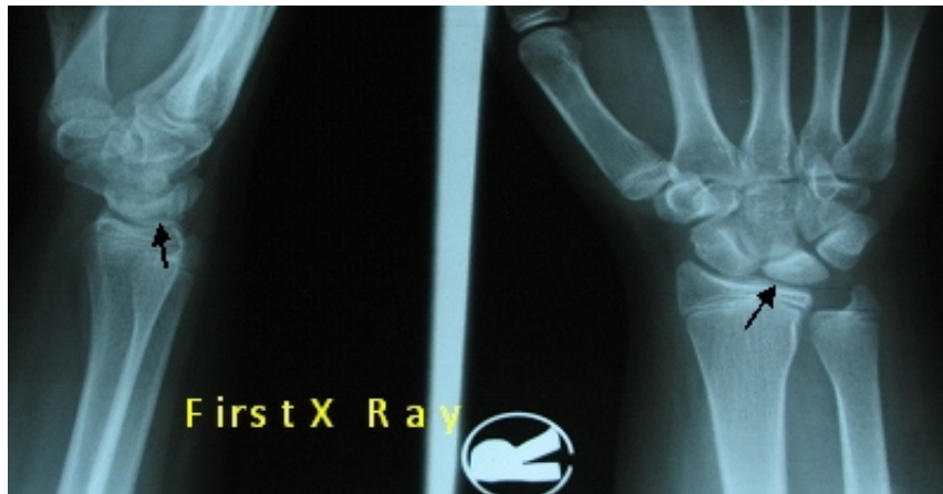
Figure 1: Radiographs showing sclerosis of lunate bone six months after the trauma.

Isotope scan with Tc 99m revealed increased lunate bone absorption and magnetic resonance imaging (MRI) confirmed signal change and deformity of lunate suggesting avascular necrosis (figure 2, 3). The patient wore a long arm cast for six weeks and stopped all of her sporting activities. In addition, she underwent physical therapy to improve hand grip strength. Clinically, wrist pain and other symptoms resolved. After one year, radiographic pattern returned to normal (figure 4), and clinical manifestations disappeared.