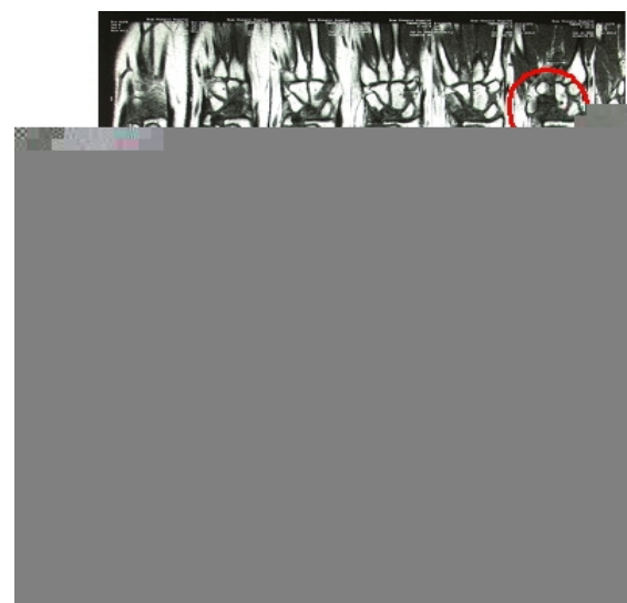
Figure 3: Magnetic resonance imaging confirming signal change and deformity of lunate six months after the trauma.

Kienbock's disease (carpal lunate necrosis or lunatomalacia) is a process of unknown etiology resulting in osteonecrosis of the lunate bone. 4 The most common clinical presentation is intermittent wrist pain, decreased wrist motion, and weakness of grip in the dominant hand.