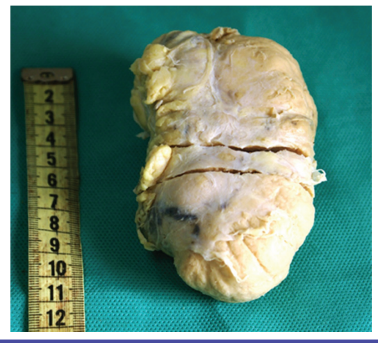
Figure 1: Macroscopic view of the resected Castleman's tumor (the tumor was shaped like an egg, covered by fibrous thick capsule, with no bizarre appearance and bleeding).

Interfollicular stroma as hyperplasia is defined as post-capillaries venules, in which