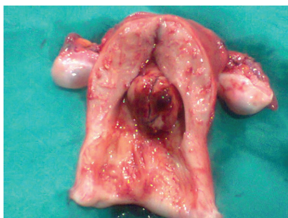
Figure 1: Cut Section of the uterus showing a polypoidal growth arising from endometrium, 5.0×4.5 cm with areas of hemorrhage. Myometrium is thickened and multiple calcifications are present. Ovaries are multicystic.

immunohistochemistry with CD10 (figure 2 and 3) confirmed the diagnosis of LGEES. According to the new 2009 FIGO Staging, it was stage IB disease. Postoperative period was uneventful and the patient was discharged after 5 days.