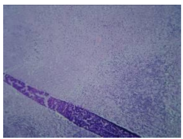
Figure 1: Excisional biopsy of the lymph node showing essentially preserved architecture with follicular hyperplasia and multiple areas of histiocytic aggregates consistent with necrosis and cell debris.

daily and prednisolone 10 mg/day was started. The patient became symptom free after few days. After one year of follow-up, the patient is still in complete remission.