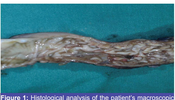
Figure 1: Histological analysis of the patient's macroscopic specimen, suggesting ulcerative colitis.

At the age of 4 months, the patient presented