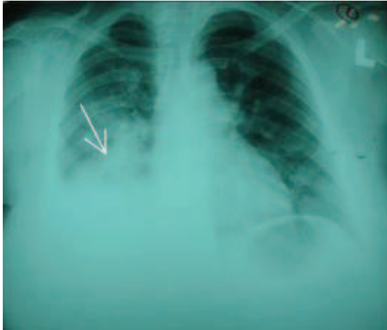
Figure 3: Chest radiography showing ground glass and collapse consolidation.