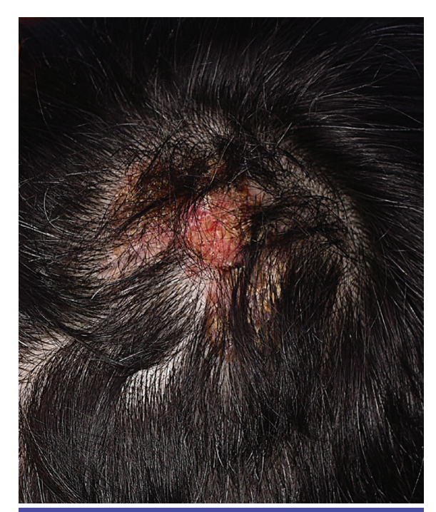
Figure 1: A 4-cm diameter lesion that appeared scaly, erythematous, crusted plaque, and alopecia confined to the parietal scalp region.

Her medical history and general physical examination were unremarkable. She also did not smoke nor consumed alcohol. There was no history of other dermatologic or autoimmune disorders among her family members. Physical examination revealed a 4-cm diameter lesion that appeared as scaly, erythematous, crusted plaque, and alopecia, which was confined to the parietal scalp region (figure 1). Since the lesion did not respond to the topical treatment and enlarged, a second biopsy with differential diagnosis of pemphigus vulgaris, pemphigus foliaceus, erosive pustular dermatosis, and cicatricial pemphigoid was conducted. The histological examination revealed atypical cell proliferation through the whole thickness of the epidermis and follicular epithelium, with dermal microinvasion along with acantholysis and clear cell formation (with pagetoid features). The tumor cells showed high nuclear pleomorphism, hyperchromatic nuclei, increased number of mitotic figures, and negative DIF (figures 2, 3). The neoplastic cells were