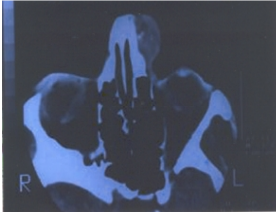
Fig1: Calcification of the tumor without any defect or bone reaction.

the same color as the skin and almost a clear border which was loosely attached to underlying tissue. The encapsulated tumor was completely removed under general anesthesia for cosmetic reasons. The mass which appeared to be lobulated and yellowish with a relatively hard consistency was sent to the laboratory for histopathological examination.