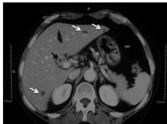
Figure 1: Abdominal computed tomography scan showed three small cysts (white arrows) and dilated common bile duct (black arrow).

Our primary impression for filling defects was common bile duct stones or sludge.