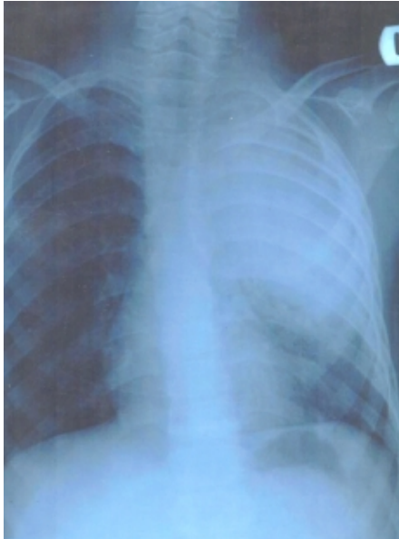
Figure 1: Chest radiography shows a large mass opacity in the left upper part of the lung.

suggestive for malignancy (figure 2). Bronchoscopy showed only erythema and inflammation of the left upper lobe bronchus. Bronchial biopsy specimen revealed nonspecific inflammatory changes. Transbronchial lung biopsy and cytology was negative for malignancy. Pathologic examination of the percutaneous fine needle aspiration of the mass also showed non-specific inflammatory process.