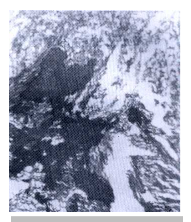
Figure 2: Organizing lobar pneumonia (Ossification) (10× 40 H&E)

We performed a left lower lobectomy and resection of mediastinal and esophageal fibrosis along with Heller myotomy of the esophagus to relieve the patient's dysphagia. Operative findings showed calcified organized lobar pneumonia, calcified Inferior pulmonary vein and mediastinum, and fibrosis in the lower mediastinum encircling esophagus. Pathologic examination revealed organized lobar pneumonia with fibrosis of lung and mediastinum and inferior pulmonary vein.(Figs.2,3) Her dysphagia was relieved to some extent after lobectomy, however one year later she began to complain of dysphagia again. She underwent esophagoscopic biopsy, which revealed fibrosis. Esophageal dilatation was performed albeit of little benefit. One year later she was operated on, in another center. No resection was possible because of severe mediastinal and upper retroperto-