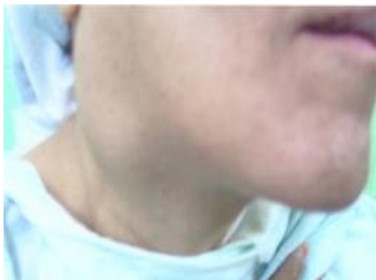
Figure 1: The patient with a painless mass in the right side of the neck