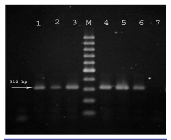
Figure 2: Amplification of the methicillin resistance (mecA) gene in a number of Staphylococcus epidermidis isolates. Lanes 1-6; mecA positive isolates, lane 7; mecA negative control, M; 100 bp DNA ladder marker.