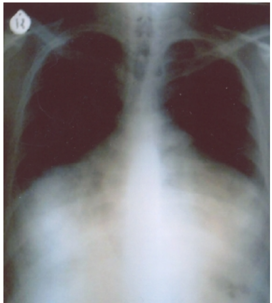
Fig 1: Chest x-ray in favor of cardiomegaly

mediastinal mass that hangs into the lower chest and extends into both hemithoraces mimicking cardiomegaly or elevation of both hemidiaphragms.<sup>6,7</sup> Lucent edges of the mass opposed to the more opaque borders of an enlarged heart is characteristic and is a clue for making the correct diagnosis.<sup>8</sup> Computed tomography is specifically showed fat attenuation. The soft tissue may appear as linear whorls intermixed with fat.<sup>4,5,7</sup> Since computed tomography is not always diagnostic, some authors recommend fine-needle aspiration biopsy.<sup>9</sup>