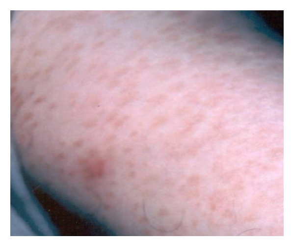
Fig 1: Dermal papules and annular plaques on the forearm

Punch biopsies of the subcutaneous nodules taken from multiple sites revealed collagen degeneration surrounded by epithelioid histiocytes and multinucleated giant cells, as well as increased exteracellular mucin, consistent with GA (Fig 2). Both the uveitis and skin lesions responded initially to topical and systemic steroids, but relapsed concurrently during steroid tapering.