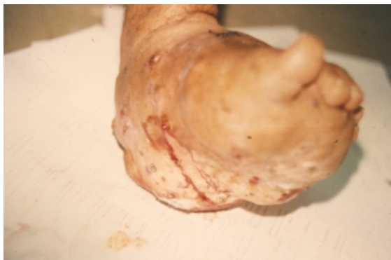
Figure 2: Multiple sinus openings in foot.

The skin of the affected area of her left foot was cleansed with 70% alcohol. The pus was then collected in a sterile plate after applying pressure around the sinus tracts. On direct examination of the collected pus, yellowish soft large and lobulated granules were observed. Direct smear from the crushed grains, stained with Gram and Kinyon acid fast staining, revealed Gram-positive and non-acid-fast branching filaments with a diameter less than one \mu\text{m} . Histopathologic examination of the granules revealed the presence of a dense peripheral border and loose and empty center (figure 3). Granules were washed in sterile saline. They then were crushed and cultured in duplicate on Sabouraud's dextrose agar (SDA), blood agar and brain heart infusion agar (BHI). Cultures were incubated at both 27°C and 37°C for several weeks. No growth was obtained after six weeks of incubation.