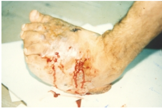
Figure 1: Actinomycetoma of foot.