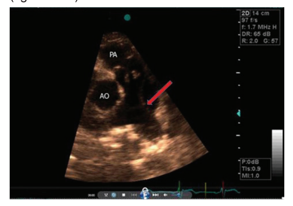
Figure 1: short axis parasternal view showing thickened and dome shaped pulmonary valve and intimal flap in lateral wall of main pulmonary artery (Red arrow).

The patient was asymptomatic and serial follow up echocardiography showed no other complications. At the recent presentation, fifteen years after valvuloplasty, the patient was still asymptomatic and had a systolic murmur on the upper left sternal border. The transthoracic echocardiography showed mild RV enlargement with normal function, mild to moderate residual PS (peak PG=46 mmHg, mean PG=32 mmHg), moderate PI, mild TR and RVSP~50 mmHg. An intimal detachment was seen in lateral side of PA trunk from ST junction to PA bifurcation (PA annular=2.4 cm); although this complication was revealed in off axis views and then in RVOT view. The entry site was seen clearly by contrast study (figures 1-3).