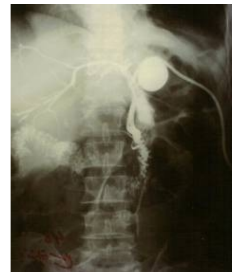
Figure 2: T-tube cholangiography shows normal diameter of the choledochus and right hepatic duct with normal drainage of contrast into the duodenum. Left hepatic duct was closed because of the left lobectomy of the liver.

After administration of broad-spectrum antibiotics, the patient was scheduled for surgery. After posterolateral thoracotomy and disconnection of thoracobiliary fistula, the diaphragm was opened. The left hepatic lobe was occupied by a large calcified hydatid cyst with no more viable healthy tissue. Left liver lobectomy was performed. After cholecystectomy and exploration of choledochus and T-tube drainage, subdiaphragmatic drainage was performed (figure 2). Pathologic examination revealed calcified hydatid cyst of the liver with multiple gelatinous and brown membranous tissue and severe cyst wall calcification in the left lobe. There was a little hepatic tissue around the calcified hydatid cyst. The patient was discharged 15 days later and T-tube was extracted 34 days after operation. Two-year follow-up of the patient was satisfactory.