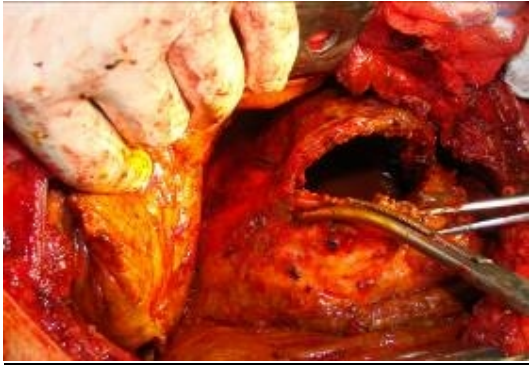
Figure 3: Calcified Hydatid cyst of the right lobe of the liver through opened pleurobiliary fistulous tract are shown after right thoracotomy and decortication of the lung.

there was not any fistula to the lung. Fistula of the liver on diaphragm to pleural space was opened and calcification of compressed biliary contents was almost totally excised (figure 3). On excision of the calcified part, hemorrhage was severe, but it was controlled. Between 1 to 2 cm of calcification of the depth of cyst was adhered to inferior cava and superior hepatic veins, which remained intact. Biliary fistulae were closed partially by suturing with Vicryl. Partially calcified liver cavity and bare area of the liver drained separately through sub diaphragm. In macroscopic pathologic examination there was multiple creamy brownish membranous tissue and severe cyst wall calcification. In microscopic examination there was brown yellowish laminated membrane with destruction of germinative layer and scolices, and sever fibrosis and calcification of pericyst layer, which confirmed calcified liver hydatid cyst. One-year follow-up of the patient was satisfactory.