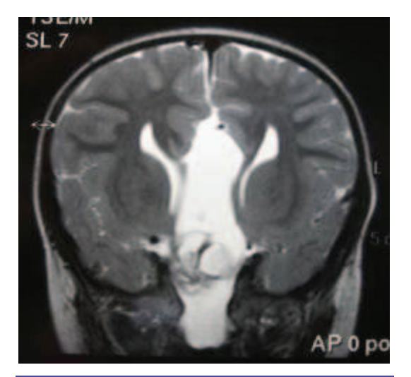
Figure3: Coronal MRI shows an intracranial lesion with extension to nasopharynx.