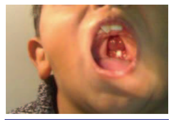
Figure 1: Cleft palate and a pulsatile epipharyngeal mass can be seen.

compressible, and pulsatile. Figure 1 shows complete secondary cleft palate and a epipharyngeal mass.