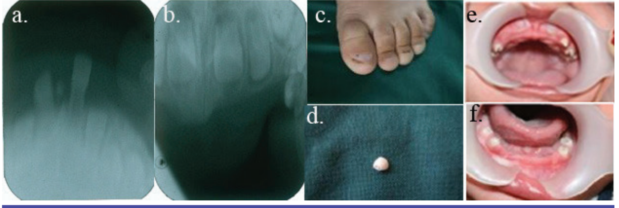
Figure 1: These are the clinical and radiographic manifestations of the patient's condition. a. The mandibular anterior permanent germ in periapical view. b. The maxillary anterior permanent germ in periapical view. c. The child's toenails are spoon-shaped and hypoplastic. d. The exfoliated mandibular primary canine. e and f. Clinical absence of all the maxillary primary incisors and mandibular anterior permanent.

but no abnormality was reported. Oral examination of the patient's parents revealed complete normal dentition and no abnormalities of the nails, scalp, hair, and eyebrows. There was no history of similar anomalies in the patient's other family members except for a cleft palate in one of his maternal cousins. Genetic analysis was performed after obtaining written informed consent from the parents according to the ethical protocol of Shiraz University of Medical Sciences. DNA was isolated from peripheral blood leukocyte collected in EDTA via the standard salting out method. Two coding exons, exon-intron boundaries, and part of 3'-UTR of MSX1 were polymerase chain reaction (PCR) amplified, and the amplicons were subjected to mutation analysis by bidirectional direct sequencing (Bioneer, Korea). Amplification was performed for 3 minutes at 95°C, followed