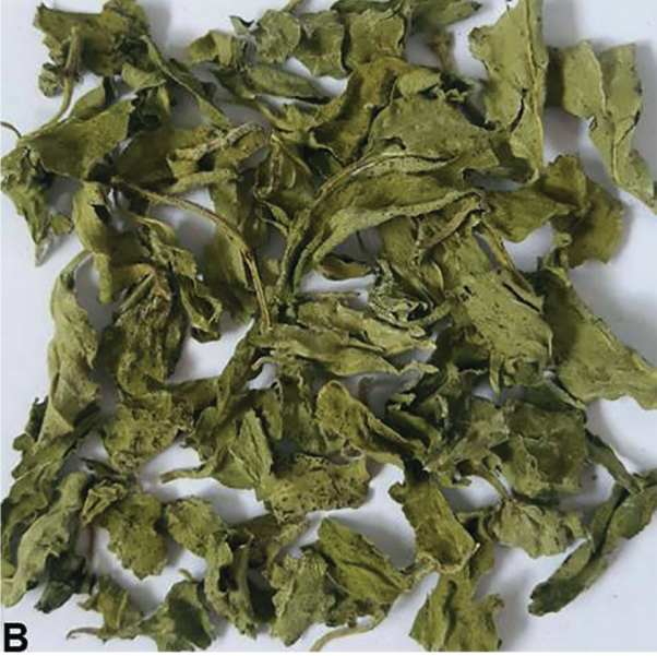
Figure 1: The morphology of S. khuzestanica (A) and Z. multiflora (B)