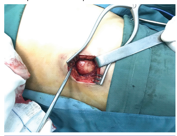
Figure 2: Thoracic wall mass was observed during surgery.

showed that the thoracic wall mass extended to the posterior abdominal wall and was entirely extrapulmonary and extraperitoneal (figure 2). Subsequently, all cystic structures of the thoracic wall and intrathoracic region were removed and the primary defect was reconstructed. Histopathological examination of the resected sample indicated HC. The postoperative period was uneventful and the patient was discharged tw days after the surgery and had a good recovery. Albendazole 400 mg (Mediva Lifecare, Haryana, India) was prescribed for four weeks postoperatively. During 2 years' follow-up, there were no complications nor any signs of recurrence. Written informed consent was obtained from the patient for the publication of the present case report.