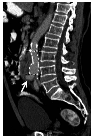
Figure 2: Sagittal reformat contrast-enhanced computed tomography images show the growing aneurysm sac by type 1B endoleak and the expanding tubular stent graft at the distal end due to the growing aneurysm.

The patient was admitted to the emergency room with a septic syndrome after 14 months. Laboratory values demonstrated leukocytosis, neutrophilia, and increased C-reactive protein and sedimentation levels. Creatinine and bilirubin levels were also above normal values. Abdominal CT scan showed that the left-sided psoas abscess had grown to 9 cm in diameter and contained air fluid levels. The horizontal segment of the duodenum was adhered to the perigraft infectious tissue (figure 3). Therefore, stent graft explantation, extensive surgical debridement, aortic ligation, and extra-anatomic right axillofemoral bypass graft reconstruction were performed. The psoas abscess was drained with a percutaneously placed large-bore catheter, and intravenous antibiotherapy was