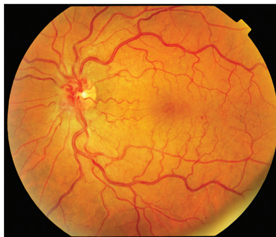
Figure 1: Shows fundus photo of the patient who was exposed to sulfur mustard showing vascular tortuosity, hemorrhages, and macular edema.

Again, we reviewed his possible use of any drug, medication (either chemical or herbal) trauma, smoking, and familial history of such