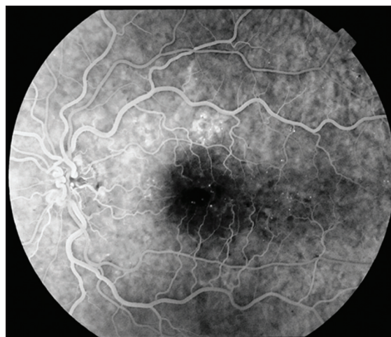
Figure 2: Fluorescein angiography showing vascular tortuosity, macular edema, hemorrhages, multiple hypo and hyperfluorescence of the fundus in a 41-year-old male patient who was exposed to sulfur mustard.