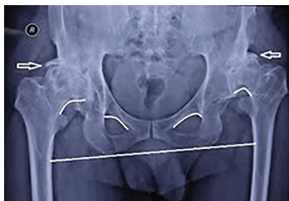
Figure 1: Pelvic X-ray view showing neolimbi and diagnostic landmarks.

The pelvic X-ray showed false acetabulum, broken Shenton's line which was worse on the left side, severe arthritis changes such as diminished joint space, ossified neolimbi on both sides as shown in figure1 (arrows), large osteophytes and bony spurs, loss of cartilage, massive sclerotic changes on both sides, dislocation on the left and subluxation on the right side. Increased anteversion of the femoral neck of the left side and lateral views are shown in lateral views of both hips (figures 2a and 2b).