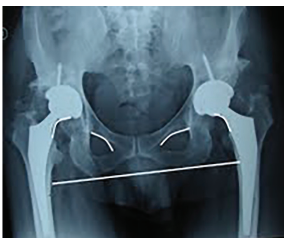
Figure 3: Post-op bilateral pelvic X-ray showing the equally spaced broken Shenton's lines.

by equally broken Shentons' lines shown in the post-op pelvic radiograph (figure 4).