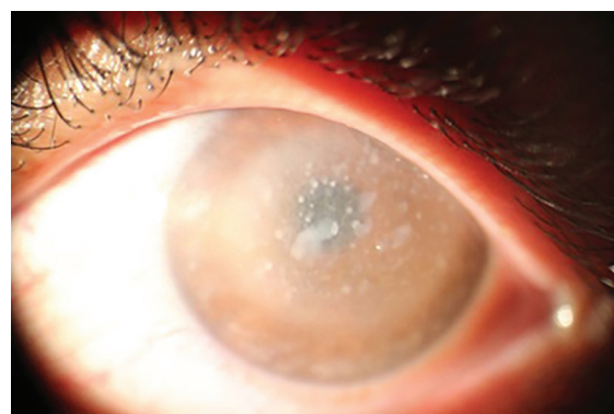
Figure 2: Gray-white patches are seen clearly that confirmed macular corneal dystrophy in this patient. This image is taken with photoslit device.