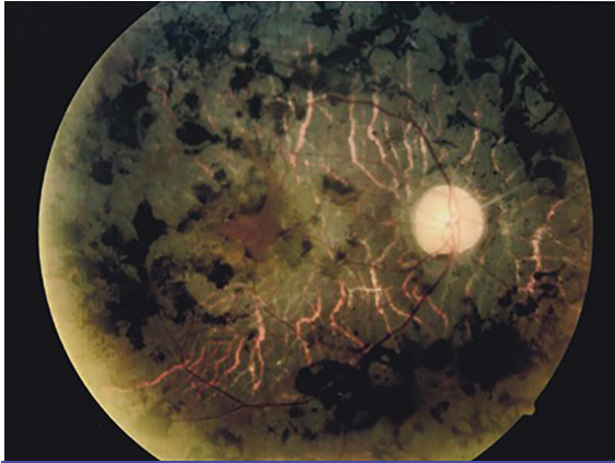
Figure 4: Appearance of the retina in one of the patients with RP is shown. The image is taken using optical corneal tomography (Optovue OCT, iFusion). Blood vessels attenuation, bony spicules, and waxy disc pallor is clearly seen in this image. All three patients showed these evidences in both eyes.

MCD and RP. Although Crawford 5 had reported a case of concurrent granular corneal dystrophy (GCD) and RP with autosomal dominant inheritance in a 58-year-old Korean woman, we present the first report of simultaneous MCD and RP. MCD is inherited as recessive autosomal and it appears to be caused by abnormal structures of creatinine sulfate, which is triggered by a mutation in CHST6 gene. 6 The most common disorder is mediated by missense or nonsense single nucleotide polymorphisms (SNPs) in CHST6, which causes a change in a protected amino acid. Heterozygous mutation in the exon 3 of CHST6 gene has been detected in most families, almost all of them are associated with another heterozygous mutation in the CHST6 coding region on the other chromosome. 7 Other mutations causing MCD relate to the insertion or deletion of nucleotides in the CHST6 coding region, which alters frame-shift and also a few upstream deletion or substitution between CHST5 and CHST6. 8