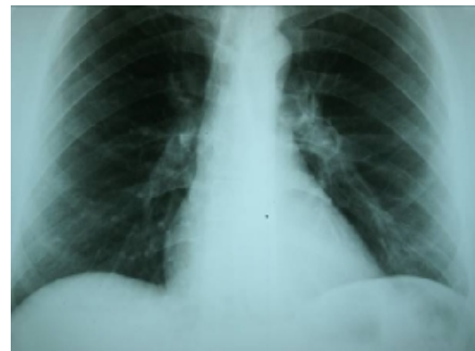
Figure 3: Chest radiograph (after treatment). Infiltration and nodules are cleared.

pulmonary embolism was made and pulmonary lesions were treated successfully with antimicrobial agents (two weeks parental clindamycin and Ceftriaxone followed by 6 weeks oral cefixime and clindamycine). The patient was improved and the lung lesions were disappeared (figure 3).