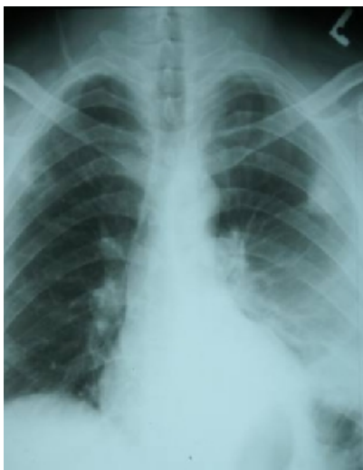
Figure 1: Chest radiograph (before treatment). A pulmonary infiltrates on the base of the left lung, a peripheral not cavitated left lung nodule and a peripheral cavitated right lung nodule.

Because the results of investigations aimed to identify the possible sources of infection were negative, a diagnosis of odontogenic septic