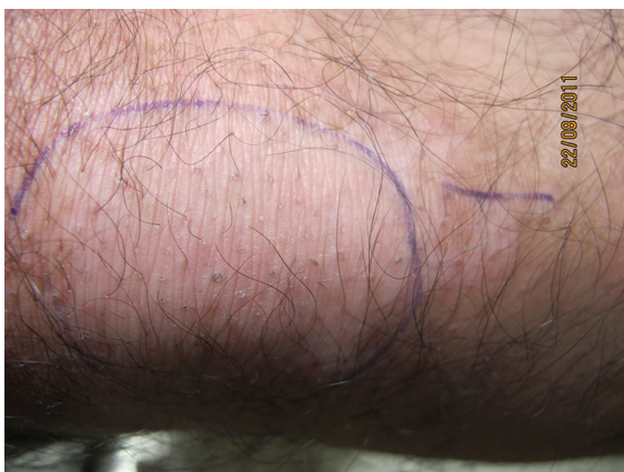
Figure 2a: Pigmentary changes on the knee before ethyl vanillate (VASI=100) are seen.

There was a significant difference between medication and placebo sides (P=0.005)