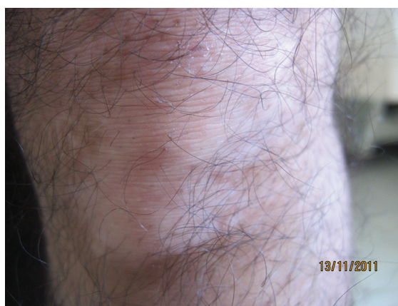
Figure 3b: Pigmentary changes on the knee after the placebo (VASI=100) are seen.

marked or excellent clinically. Ethyl vanillate was not tested in higher concentrations as we were not sure if patients could tolerate the medication or what the side effects would have been.