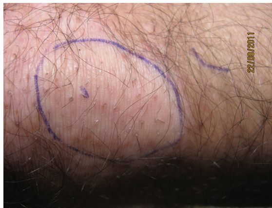
Figure 3a: Pigmentary changes on the knee before the placebo (VASI=100) are seen.

This double-blinded randomized clinical trial indicated that ethyl vanillate, as an antioxidant agent, can improve repigmentation and enhance the efficacy of NB-UVB in vitiligo patients. However, such increase in pigmentation is not