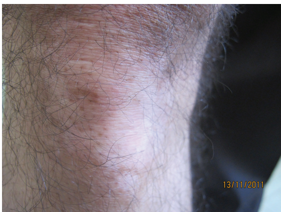
Figure 2b: Pigmentary changes on the knee after ethyl vanillate (VASI=90) are seen.

This double-blinded randomized clinical trial indicated that ethyl vanillate, as an antioxidant agent, can improve repigmentation and enhance the efficacy of NB-UVB in vitiligo patients. However, such increase in pigmentation is not