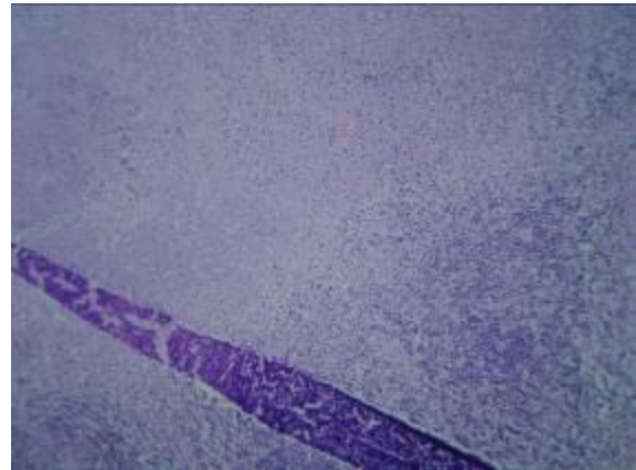
Figure 1: Excisional biopsy of the lymph node showing essentially preserved architecture with follicular hyperplasia and multiple areas of histiocytic aggregates consistent with necrosis and cell debris.

daily and prednisolone 10 mg/day was started. The patient became symptom free after few days. After one year of follow-up, the patient is still in complete remission.