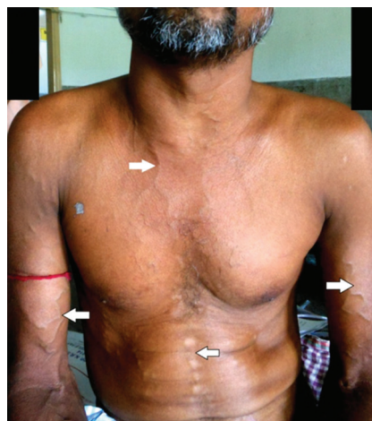
Figure 1: Venous engorgement over neck and anterior chest wall, along with visible dilated veins over upper extremities and abdomen were noted (marked by arrows).

Multiple marginally enlarged lymph nodes were noted at pretracheal, right paratracheal, subcarinal region and at aortopulmonary window; but once again, the aetiology of SVC syndrome remained undiagnosed as no lymph node or mass was found to compress SVC. An additional small well-defined heterogeneously