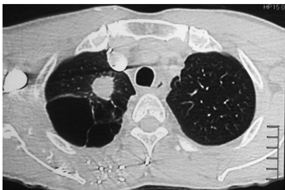
Figure 3: CT thorax (lung window) showing spiculated pulmonary nodule at the right upper lobe along with emphysematous bullae.