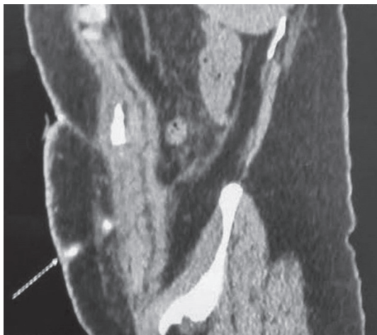
Figure 3: Computed tomography scan shows a fistulous tract in the anterior abdominal wall communicating with the skin.

can help discriminate them from GISTs and sarcomas. In the comparison of GISTs and sarcomas, the former tend to be less invasive in appearance. 6 Primary leiomyosarcomas constitute an extremely rare entity; therefore, only a handful of cases have been reported in the literature. Also, percutaneous biopsy is not preferred as it may induce skin metastasis and peritoneal dissemination. 4 A definitive diagnosis based only on preoperative clinico-radiological examination is, thus, difficult.