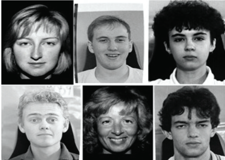
Figure 1: Samples of the stimuli presented to the subjects during the encoding condition are shown herein.

state (figure 2). Before fMRI, the subjects were instructed to remember the faces for a later test. The recognition memory test, comprised of 30 new faces and the 60 faces presented during fMRI, was done approximately 20 minutes after scanning. During the test, the subjects were asked whether the pictures were new or identical to the one previously shown. Two states were assumed for the 60 target faces: a subject can recall faces (R response) or not (F response).