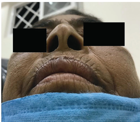
Figure 2: Significant improvement was observed two weeks after the removal of nasal abscesses.

complications are not common. However, the procedure is relatively safe, there are some reports of complications.